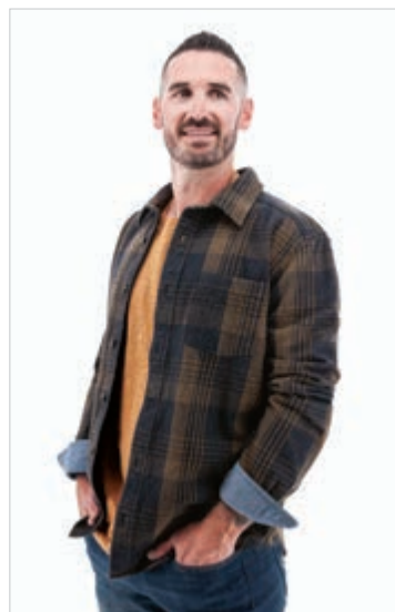
BG09 Ombre Blue