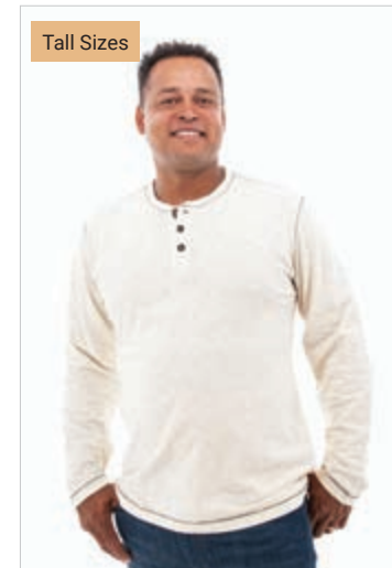
704 Whisper White