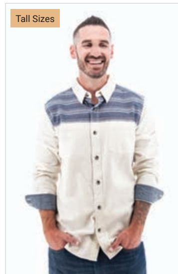
BO01 Whisper White