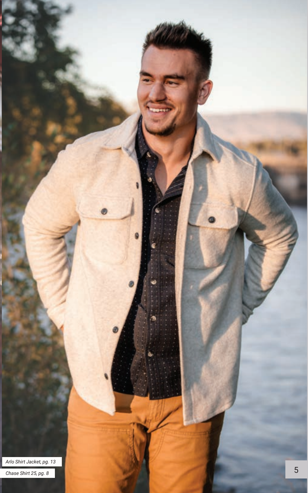
Arlo Shirt Jacket, pg. 13