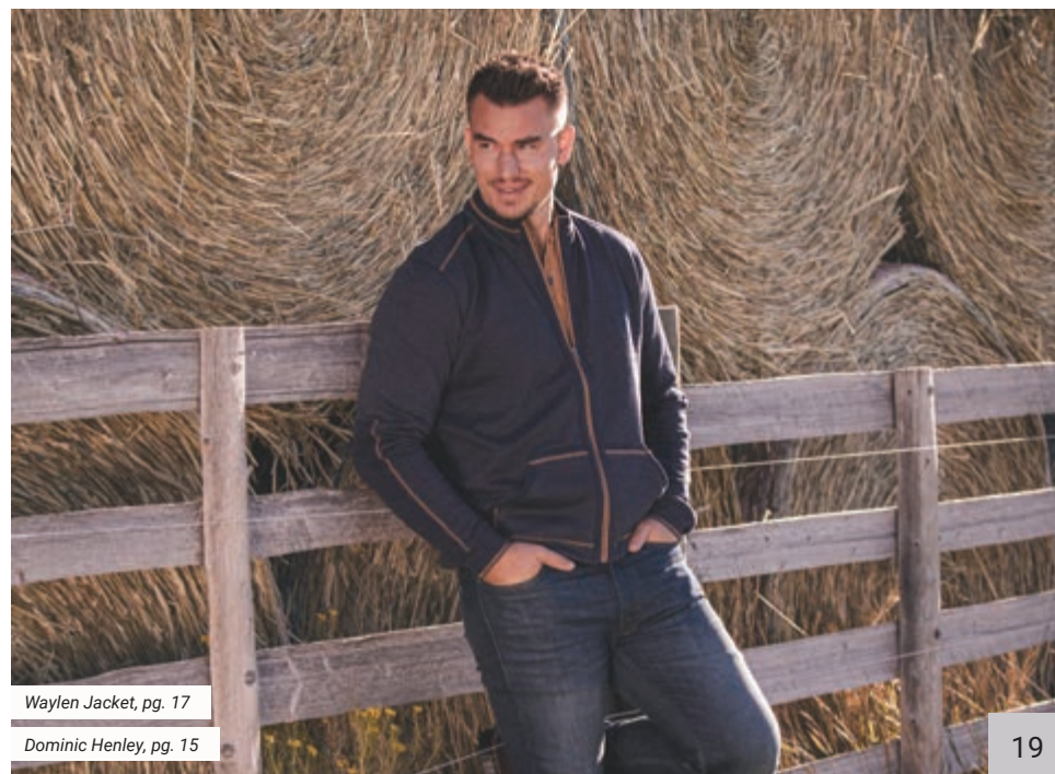
Waylen Jacket, pg. 17