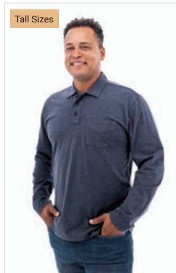
587 Ombre Blue

Premier MSRP $65.00 || Standard MSRP $59.00 || Cost $29.50