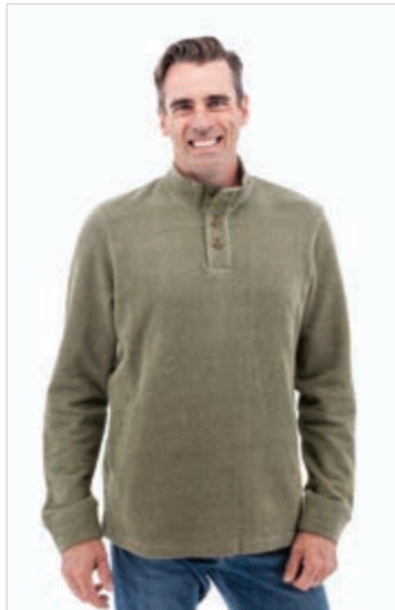
575 Burnt Olive

Premier MSRP $75.00 || Standard MSRP $69.00 || Cost $34.50