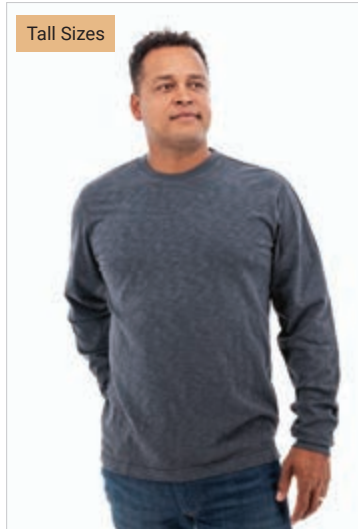
587 Ombre Blue