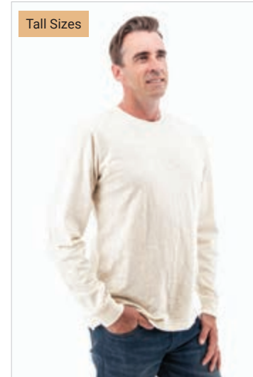
704 Whisper White