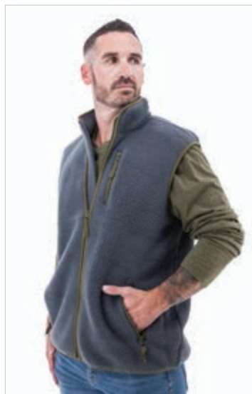
587 Ombre Blue