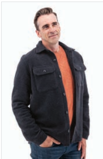
922 Dark Navy

Premier MSRP $109.00 || Standard MSRP $99.00 || Cost $49.50