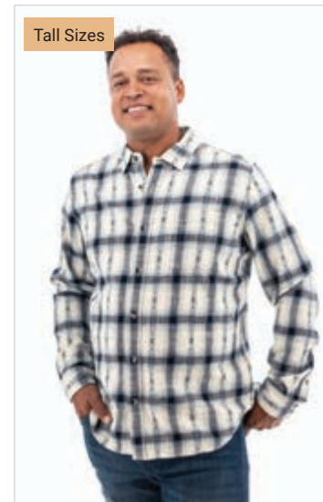
AZ61 Blue Skies