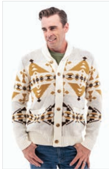
704 Whisper White

Premier MSRP $109.00 || Standard MSRP $99.00 || Cost $49.50