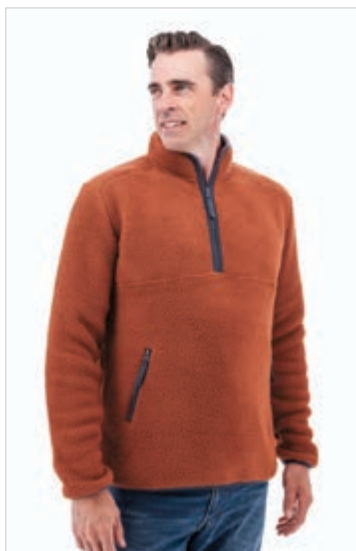
571 Arabian Spice

Premier MSRP $85.00 || Standard MSRP $79.00 || Cost $39.50