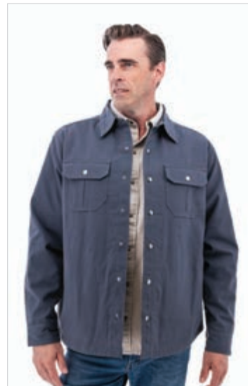
587 Ombre Blue