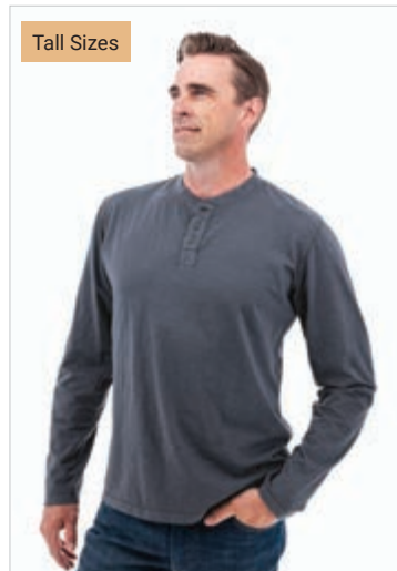
587 Ombre Blue