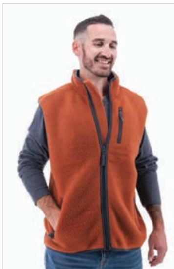
571 Arabian Spice

Premier MSRP $75.00 || Standard MSRP $69.00 || Cost $34.50