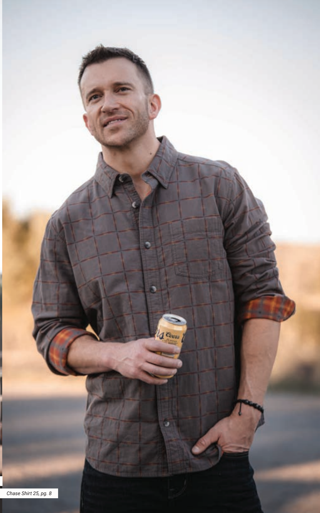
Chase Shirt 25, pg. 8