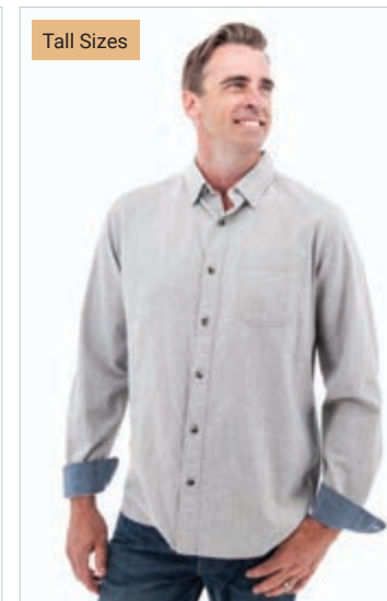
BP89 Grey Mist