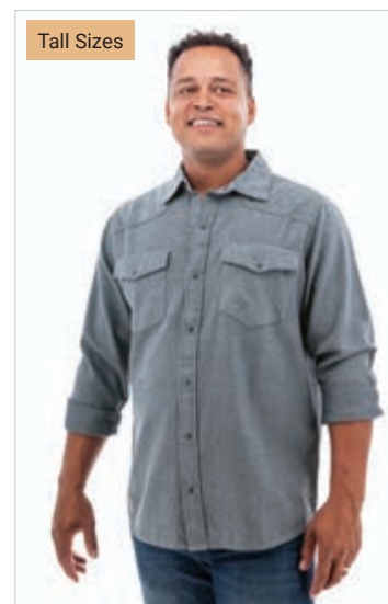
BK34 Blue Fog