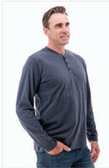
587 Ombre Blue

Premier MSRP $59.00 || Standard MSRP $55.00 || Cost $27.50