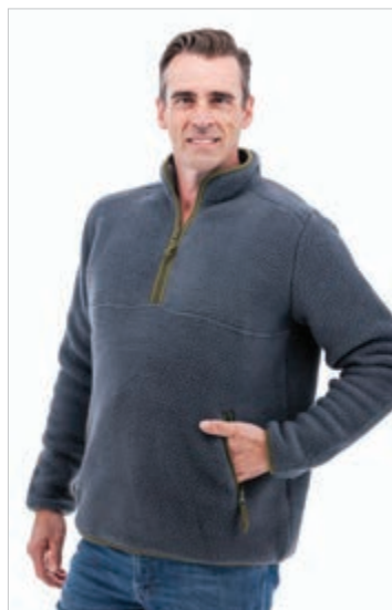
587 Ombre Blue