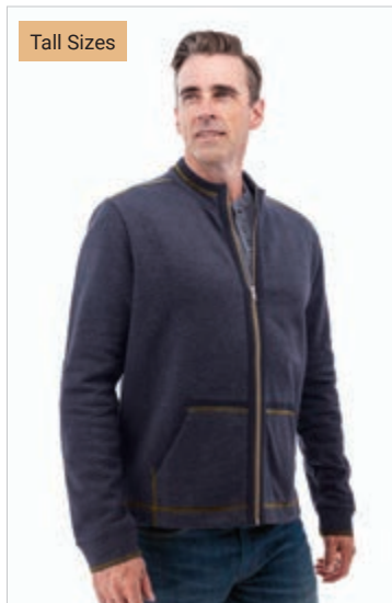
378 Black Iris

Premier MSRP $85.00 || Standard MSRP $79.00 || Cost $39.50