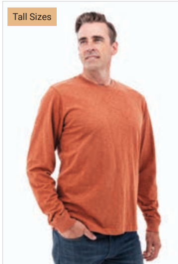
571 Arabian Spice

Premier MSRP $49.00 || Standard MSRP $45.00 || Cost $22.50