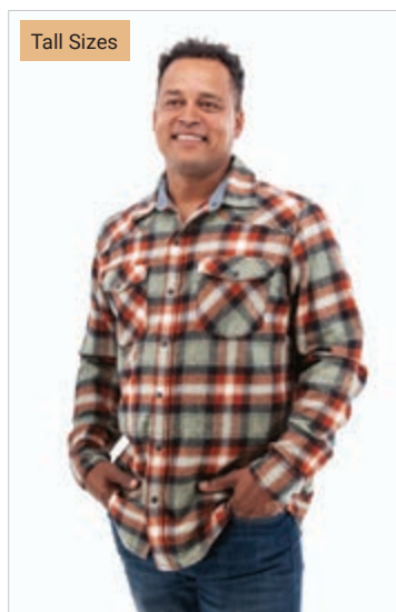
BH42 Hot Sauce