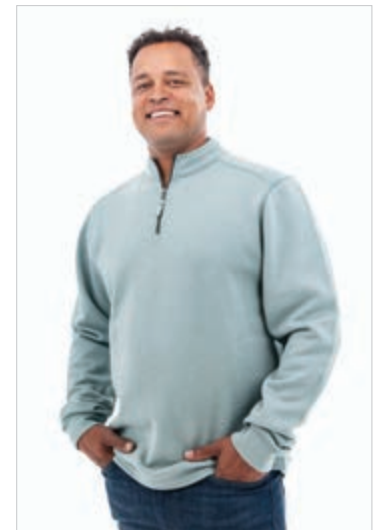
893 Sterling Blue