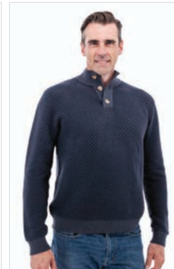
922 Dark Navy