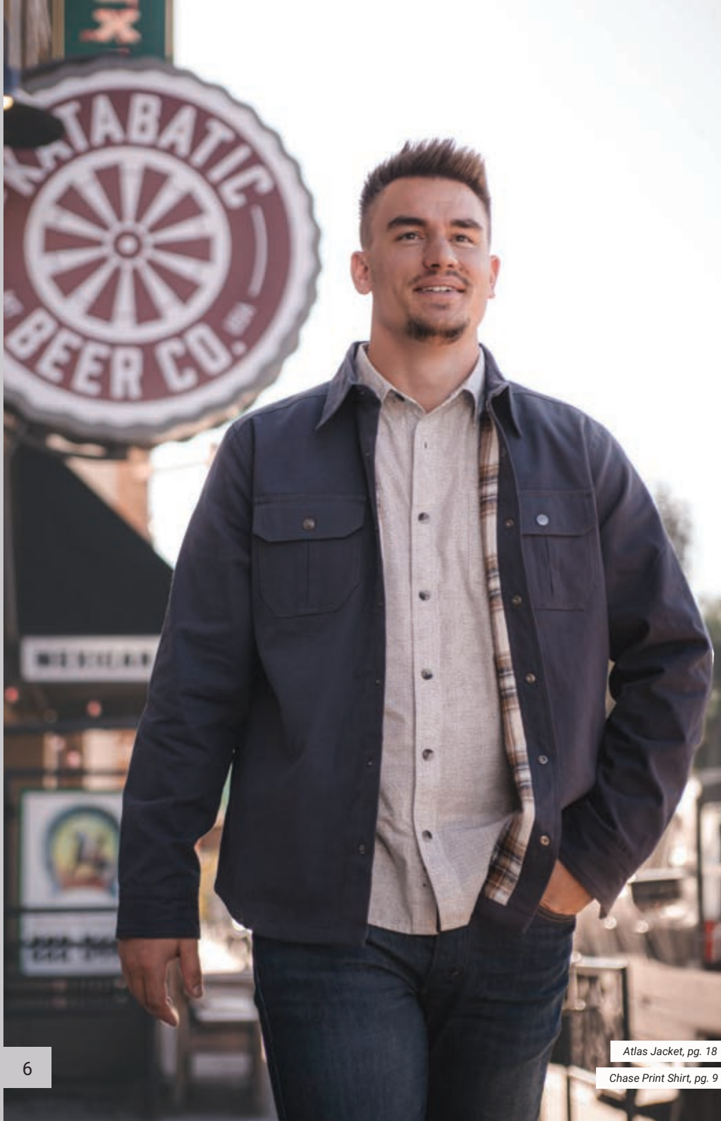
Atlas Jacket, pg. 18