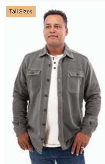
779 Smoked Pearl