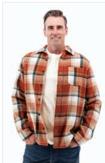
BA78 Arabian Spice