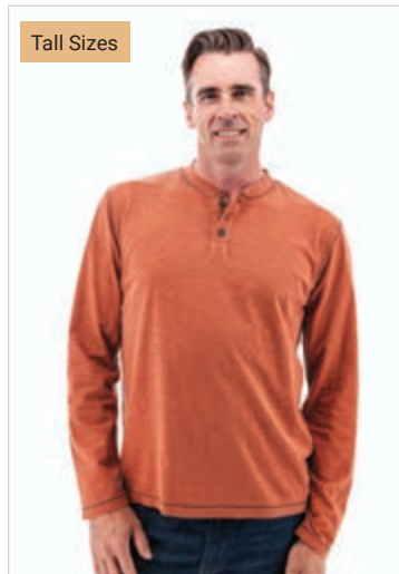
571 Arabian Spice

Premier MSRP $52.00 || Standard MSRP $49.00 || Cost $24.50