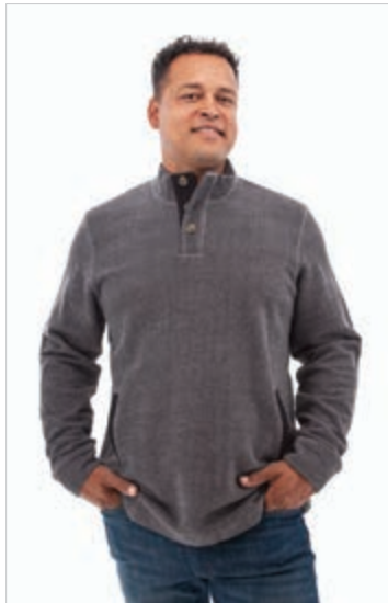
922 Dark Navy