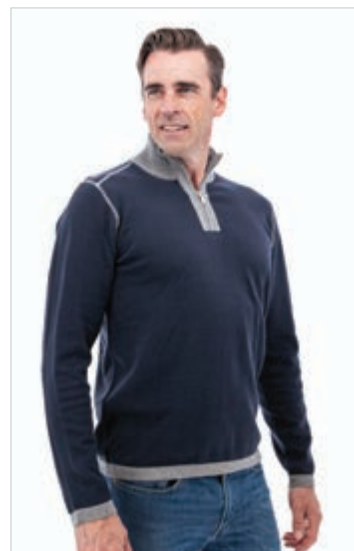
922 Dark Navy