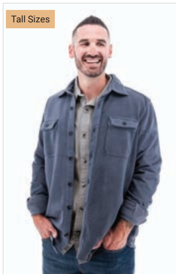
587 Ombre Blue