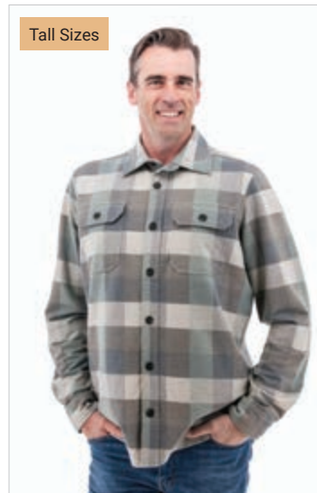
DD11 Dark Shadow