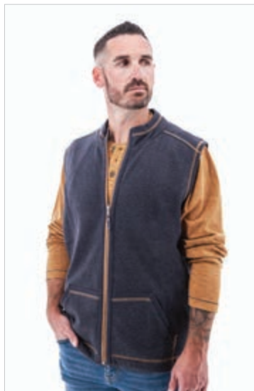
378 Black Iris

Premier MSRP $69.00 || Standard MSRP $65.00 || Cost $32.50