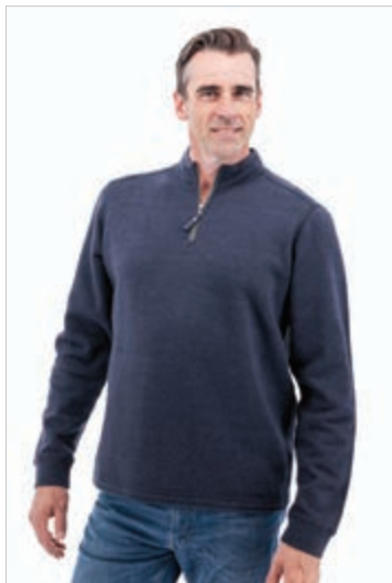
378 Black Iris

Premier MSRP $59.00 || Standard MSRP $55.00 || Cost $27.50